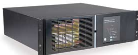
Match 19" 700-3000 VA