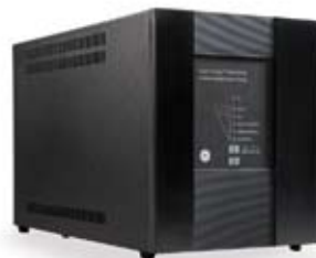
Match 500-3000 VA

500/700/1000/1500/2200/3000 VA Uninterruptible Power Supply (UPS)